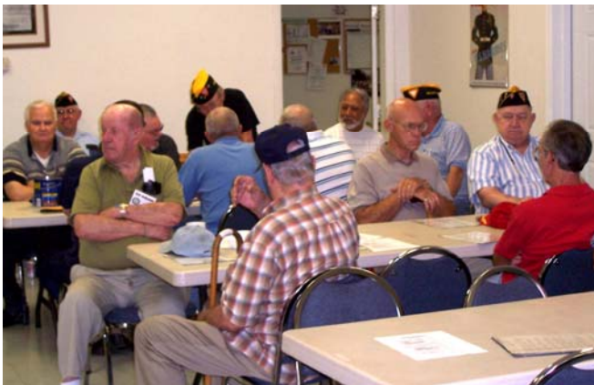
The usual crowd at monthly meetings.

Twenty-one free meal certificates were distributed for participating restaurants in the area.