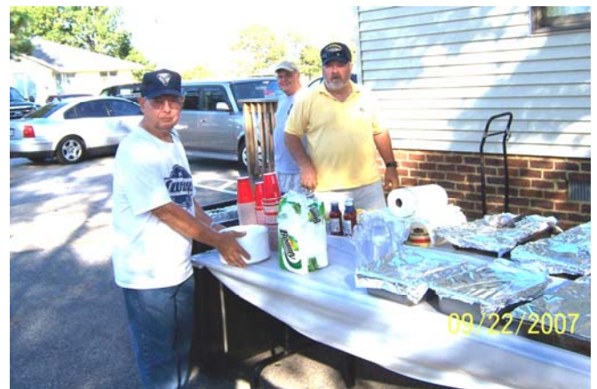
It takes volunteers

In an attempt to have more social affairs a fin and feather dinner was held on September 22 at the Branch picnic grounds. A good size crowd attended, and a good time was had by all. There was room for more people. Come on out for the next event. The food and company are both good.