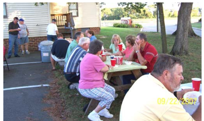
And hungry people.